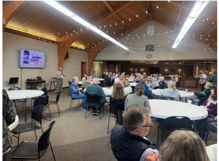
The 2026 Lenten Lunch series was a wonderful success as we prepared our hearts to celebrate Holy Week and Easter.