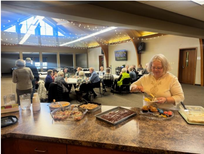
All are invited to the Commons to enjoy some friendship and treats between Sunday services on the second Sunday of every month.